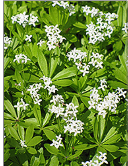
Sweet Woodruff flowers