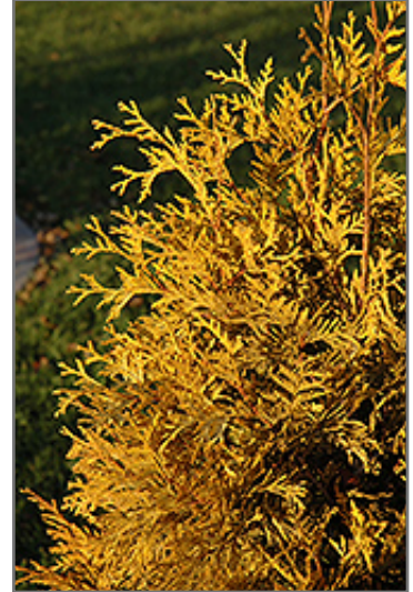
Yellow Ribbon Arborvitae in fall

This shrub does best in full sun to partial shade. It prefers to grow in average to moist conditions, and shouldn't be allowed to dry out. It is not particular as to soil type or pH. It is somewhat tolerant of urban pollution, and will benefit from being planted in a relatively sheltered location. Consider applying a thick mulch around the root zone in winter to protect it in exposed locations or colder microclimates. This is a selection of a native North American species.