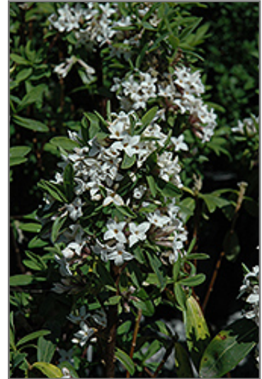
Jim's Pride Daphne flowers