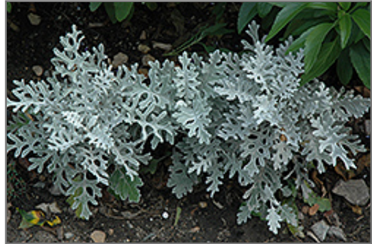
Silver Dust Dusty Miller foliage