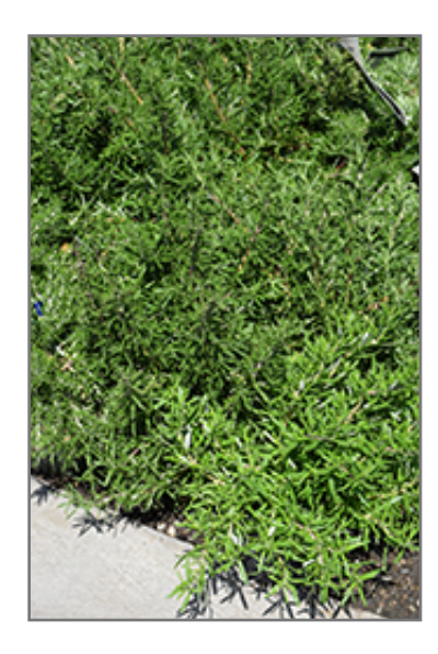
Roman Beauty Rosemary

Aside from its primary use as an edible, Roman Beauty Rosemary is sutiable for the following landscape applications;