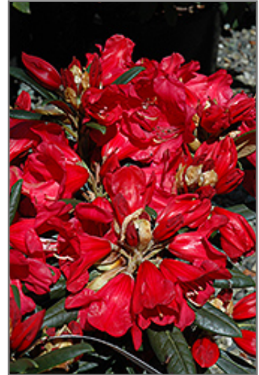
Fred Peste Rhododendron flowers

Fred Peste Rhododendron will grow to be about 4 feet tall at maturity, with a spread of 4 feet. It tends to be a little leggy, with a typical clearance of 1 foot from the ground. It grows at a slow rate, and under ideal conditions can be expected to live for 40 years or more.