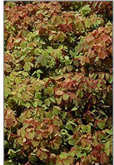
Sunset Velvet Shamrock foliage