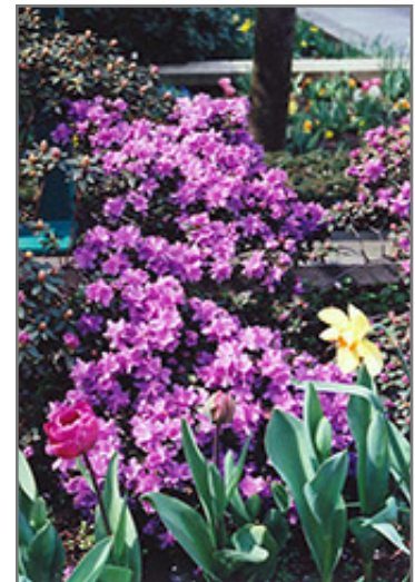
Ramapo Rhododendron in bloom