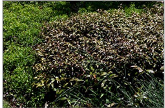
Scarletta Fetterbush