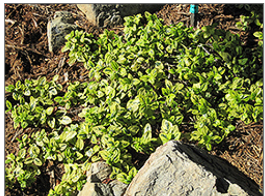
Diamond Heights California Lilac