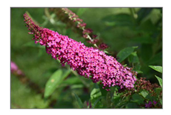
Miss Molly Butterfly Bush flowers

Miss Molly Butterfly Bush is recommended for the following landscape applications;