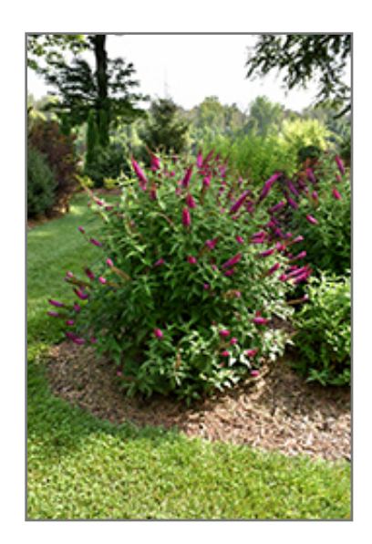
Miss Molly Butterfly Bush in bloom