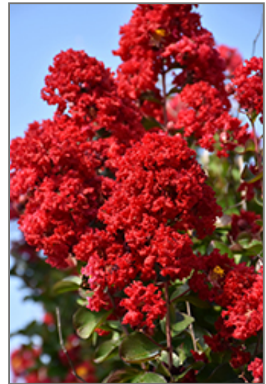
Dynamite Crapemyrtle flowers