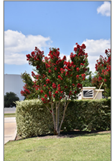
Dynamite Crapemyrtle in bloom