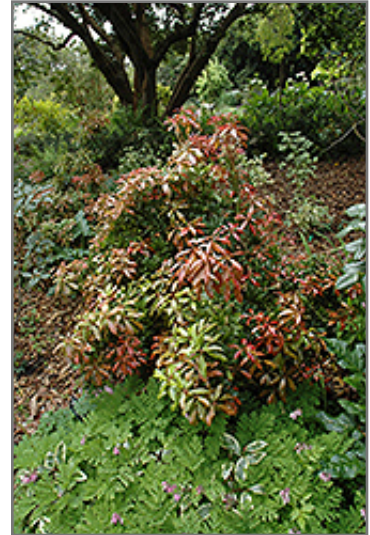
Mountain Fire Japanese Pieris

This shrub does best in full sun to partial shade. It requires an evenly moist well-drained soil for optimal growth, but will die in standing water. It is very fussy about its soil conditions and must have rich, acidic soils to ensure success, and is subject to chlorosis (yellowing) of the foliage in alkaline soils. It is somewhat tolerant of urban pollution, and will benefit from being planted in a relatively sheltered location. Consider applying a thick mulch around the root zone in winter to protect it in exposed locations or colder microclimates. This is a selected variety of a species not originally from North America, and parts of it are known to be toxic to humans and animals, so care should be exercised in planting it around children and pets.