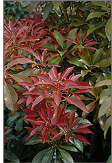
Mountain Fire Japanese Pieris in spring