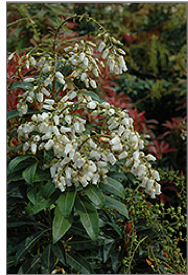
Mountain Fire Japanese Pieris flowers