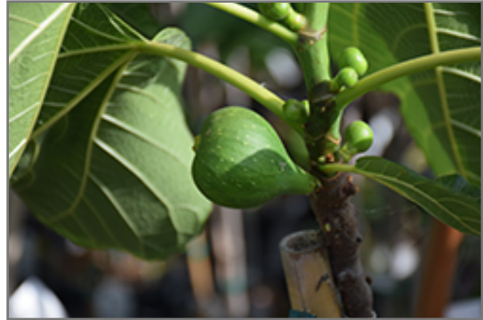
Peter's Honey Fig fruit

Aside from its primary use as an edible, Peter's Honey Fig is suitable for the following landscape applications;